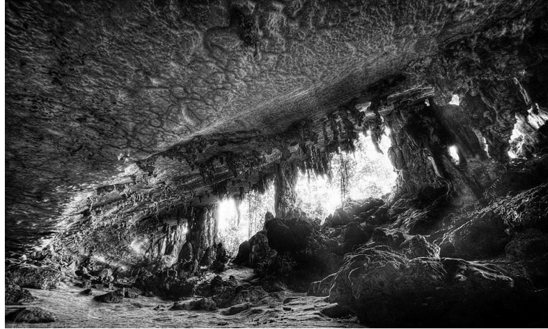
Niah National Park

Niah National Park, located within Miri Division, Sarawak, Malaysia, is the site of the Niah limestone cave and archeological site. Niah National Park was 31.4 km 2 when it was gazetted in 1974. Nomination for World Heritage status of the Niah Caves was sent to UNESCO in 2010.